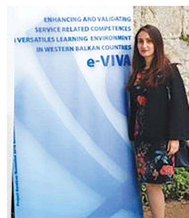
■ EU VILLAGE 2019

During the week of 6-10th of May 2019, which coincides with the European week, the University of Elbasan "Aleksander Xhuvani" (UEAXH) organized the Erasmus+ Info Week with the participation of many partner universities from different countries. Various activities were organized, including an Erasmus+ Fair. An important part of this Fair was the presentation of the e-VIVA Project as an innovative CBHE initiative for UEAXH staff and students. Participants were introduced with the purpose and objectives of this project, the project partners, as well as the activities planned to be implemented in the upcoming months.