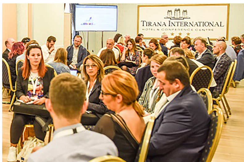
■ CONTACT SEMINAR, TIRANA