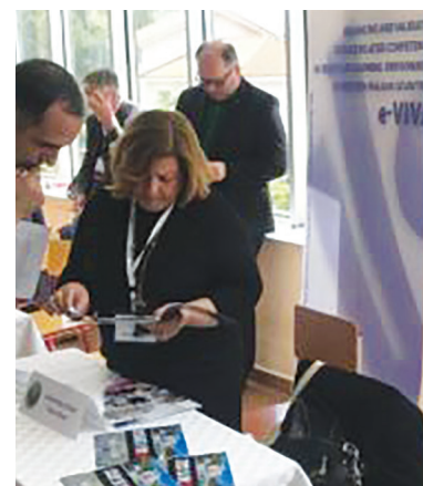
■ ERASMUS+ INFO WEEK, ELBASAN