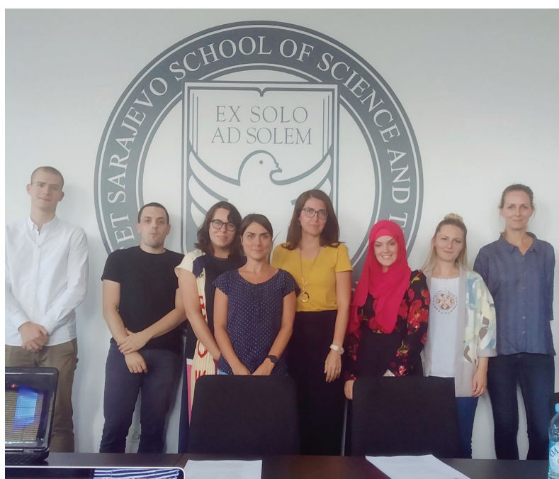
■ FOCUS GROUP SSST, SARAJEVO