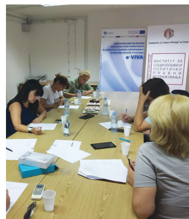
■ FOCUS GROUP UKIM, SKOPJE