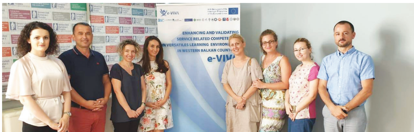
■ MONITORING VISIT AT UET, TIRANA