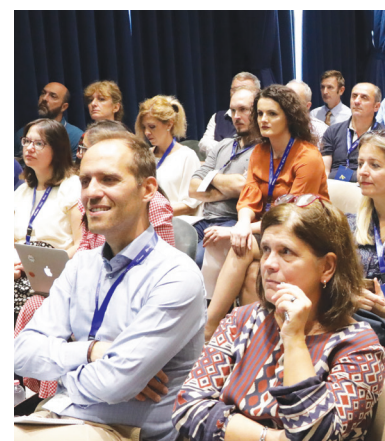
■ CLUSTER MEETING, DURRES

e-VIVA Project was presented at the 'Regional Cluster Meeting on CBHE projects' impact in the Western Balkans (WB)' which gathered the coordinators of the CBHE projects implemented in WB and was organized on 22-23 October 2019 in Durres (Albania). The meeting was organized by the Education, Audiovisual and Culture Executive Agency (Brussels), and the National Erasmus+ Office in Albania. The meeting aimed at discussing the EU funded projects/programmes impact on the WB HE sectors in terms of regional cooperation, modernisation, accessibility and internationalisation of the HE, CBHE projects producing an impact on higher education systems and promoting reforms at national and/or regional level, as well as convergence with the EU developments in higher education. Additionally, the cluster meeting aimed at facilitating exchanges of good practice and networking of CBHE projects to enhance their quality, impact and sustainability.