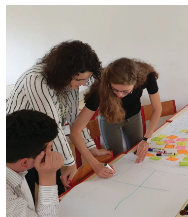
■ MEETING IN LISBON