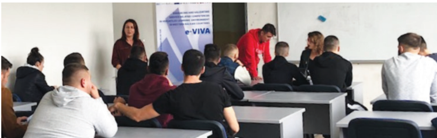
■ FOCUS GROUP UMT, SKOPJE