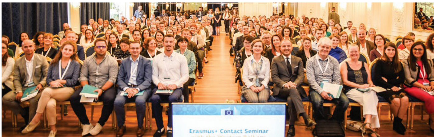
■ CONTACT SEMINAR, TIRANA