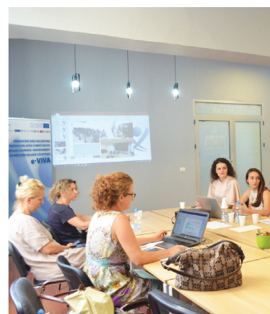
■ MONITORING VISIT AT UET, TIRANA