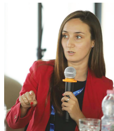
■ CLUSTER MEETING, DURRES