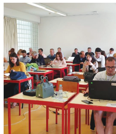
■ MEETING IN LISBON