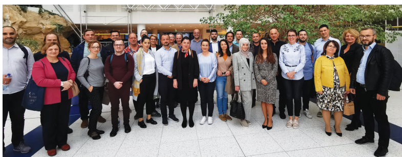
■ MEETING IN VIENNA

From 24th to 25th of October 2019, the third project meeting was organized at the premises of the host institution, die Berater in Vienna. This event included both Management Meeting and training of the e-VIVA Staff. Management Meeting agenda was Management Meeting agenda was focused on several key issues related to the e-VIVA Project implementation such as WP1 deliverables and transnational report, manual and descriptive pattern of the learning project/activity, inventory of sub-competences, reference systems, didactic frame, competence framework, learning objects and modules, catalogue of suitable assessment systems, etc. The 2nd day was entirely dedicated to three consecutive training sessions provided by the Programme countries partners.