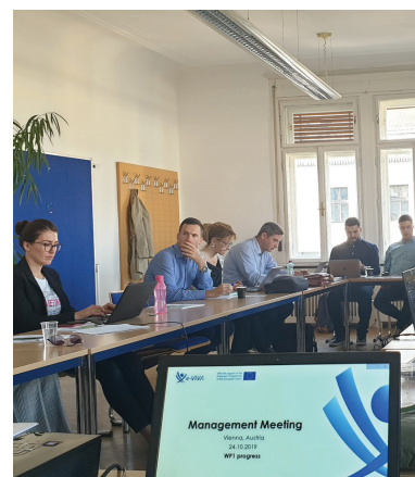
■ MEETING IN VIENNA