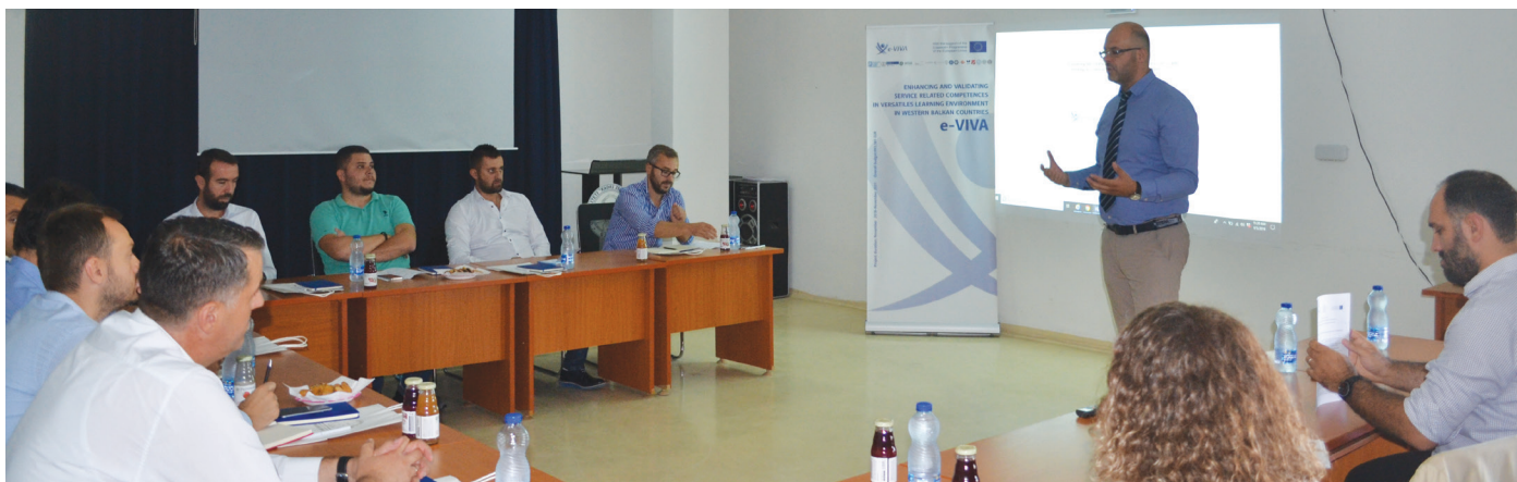
■ FOCUS GROUP UKZ, GJILAN