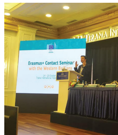
■ CONTACT SEMINAR, TIRANA