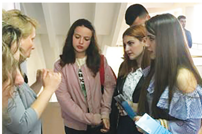
■ ERASMUS+ INFO WEEK, ELBASAN