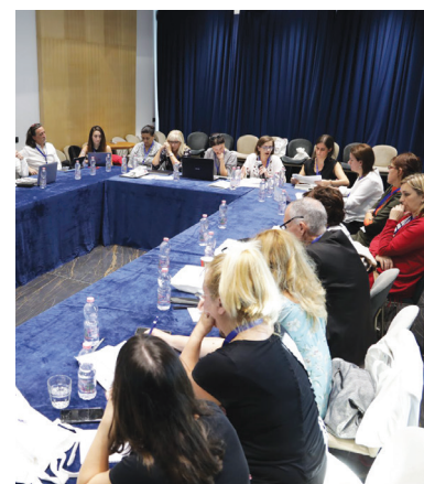
■ CLUSTER MEETING, DURRES