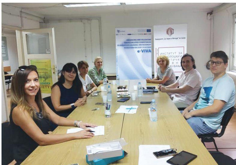
■ FOCUS GROUP UKIM, SKOPJE

e-VIVA research team at the Institute for Sociological, Political and Juridical Research UKIM organized a focus group with staff and students as well as business sector representative focused on service-oriented competences. This activity was held in the framework of WP implementation activities and the collected data were process and presented in the institutional, national and transnational reports.