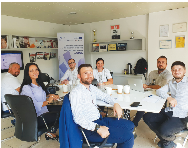
■ FOCUS GROUP UC, PRISTINA

e-VIVA research and implementation team at Universum College and "Kadri Zeka" University Gjilan in Kosovo met to discuss the upcoming project tasks and coordinate actions related to the successful implementation of WP1 activities. Additionally, partners discussed about the upcoming dissemination activities and they agreed for more coordinated efforts to ensure a wider outreach.