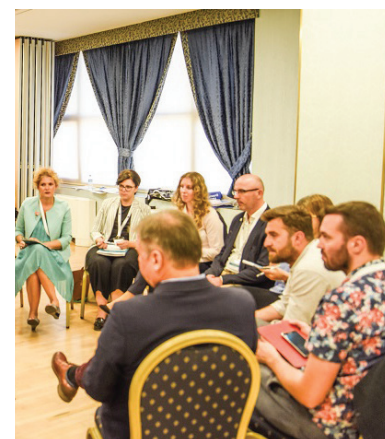
■ CONTACT SEMINAR, TIRANA