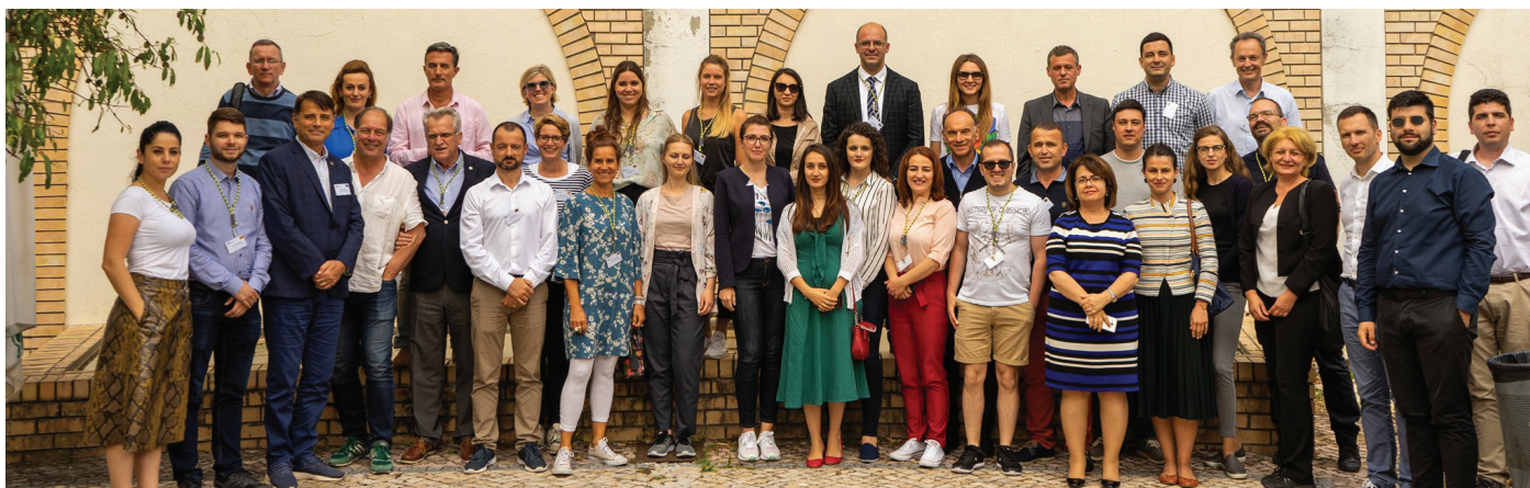
■ MEETING IN LISBON