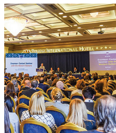
■ CONTACT SEMINAR, TIRANA

This publication was produced with the financial support of the European Union. Its contents are the sole responsibility of the e-VIVA consortium and do not necessarily reflect the views of the European Union.