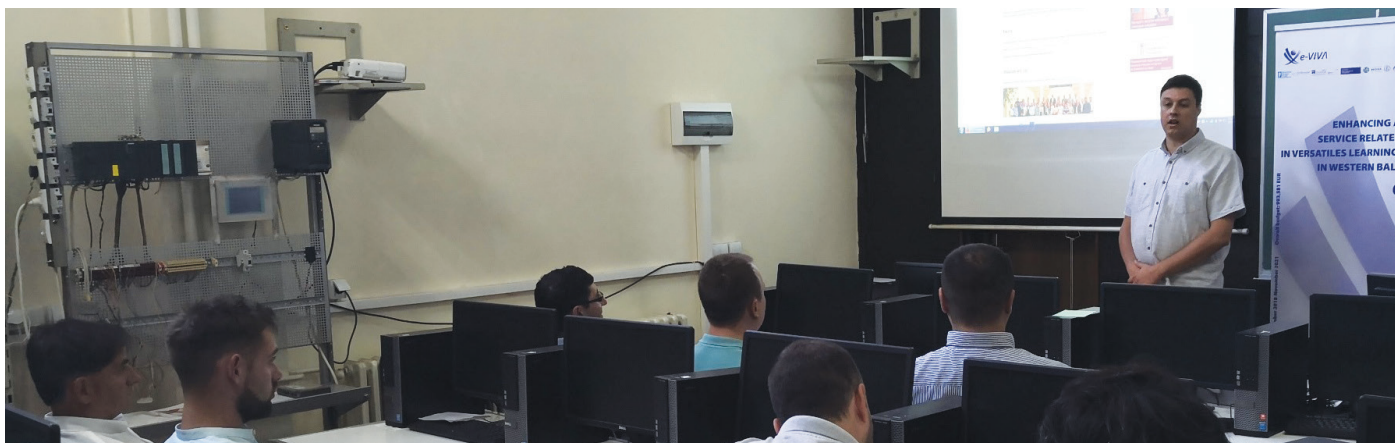
■ e-VIVA PROJECT AT UNI, NIS