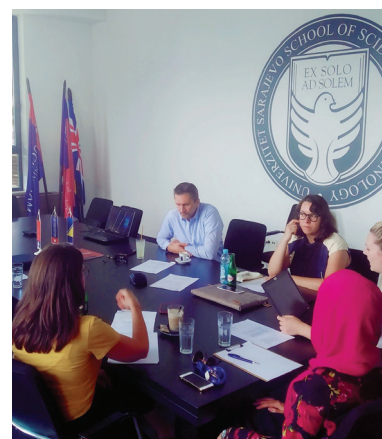
■ FOCUS GROUP SSST, SARAJEVO

This activity was held in the framework of WP implementation activities and the collected data were process and presented in the institutional, national and transnational reports.