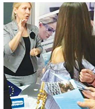
■ ERASMUS+ INFO WEEK, ELBASAN

It was an activity full of entertainment and information dedicated to Europe and with a relatively high number of participants from Albanian HEIs (students and staff).