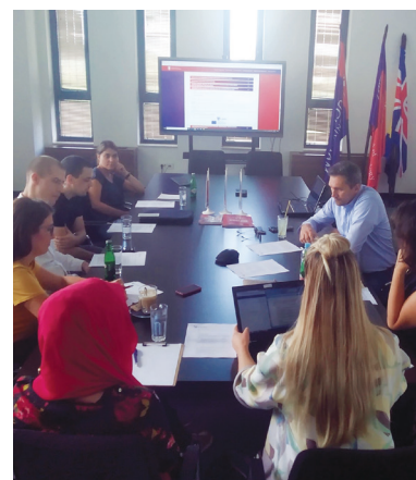
■ FOCUS GROUP SSST, SARAJEVO