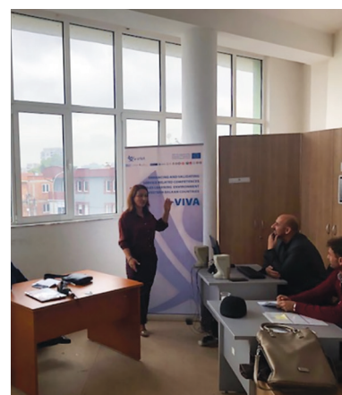
■ FOCUS GROUP UMT, SKOPJE

The SSST' research team from the Computer Science and Information Systems Department, as part of the ongoing e-VIVA Erasmus+ CBHE project organized focus group and interviews on service-oriented competences with representatives from academia (staff and students) and business sector. This activity was held in the framework of WP implementation activities and the collected data were process and presented in the institutional, national and transnational reports.